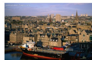
Aberdeen City and its harbour

ing, Surfing, White water rafting, Open canoeing and Rock climbing, provided by various specialist outdoor activity providers.